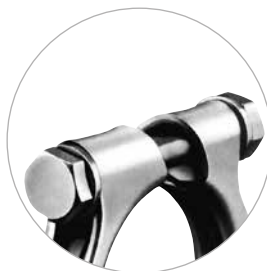
M10 and M12 version with hexagon-head bolt.