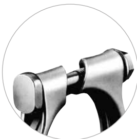
M8 version with hammer head bolt.

** Under bolt head (select nominal diameters only).